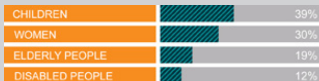
Figure (2): The most vulnerable groups in Alkhokhah and Al Garrahi

According to figure 2, the highest health needs occur on children in the tow districts of In addition, women are the second group affected by the intense fight in 30% of the population. 19% of elderly people are directly affected by the conflict . The last is 12% who were determined as disable people influenced by ware.