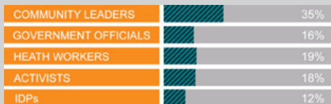
Figure( 1 ): Interview participants

According to figure 1.1, the assessment team examined and addressed the vulnerability level through the interviews included 8 government officials, 19 community leaders, 13 health workers, 7 activists, 6 of the conflict-affected communities and 5 IDPs in the two districts. The assessment team had recognize the vulnerable population priorities according to Sphere Standards and Yemen Humanitarian Response Plan (2016) in order to satisfy the objectives of determining the most urgent health care needs supporting the evidence for decision-making.