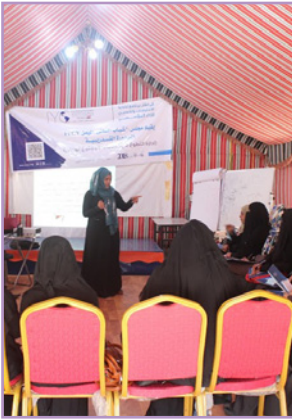
Ensuring social cohesion

The International Youth Council - Yemen is based on four axes in its work :