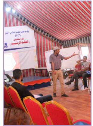
Empowerment and Leadership

Enhancing trust-based relationships between youth and institutions and coordinating with institutions in achieving leadership for youth in all fields, building their capacities, supporting, encouraging and honoring their ideas and products, which enhances the process of creativity and innovation and the beginning of advanced stages of life.