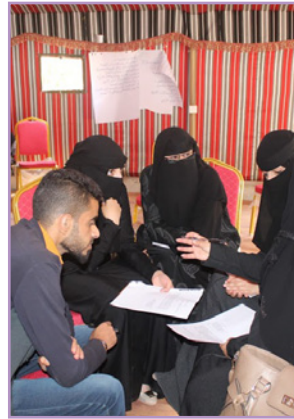
Entrepreneurship, creativity and innovation

Recruiting the resources and increasing the effectiveness of the available possibilities and highlighting the role of partners in the development of youth in various forms and increase the spaces allocated to youth, which leads to increased capacity to give, which contributes to create a readiness for youth to compete in a positive way.